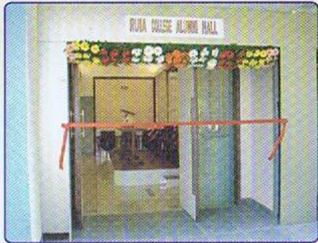
RCAA Hall – All set to 'open up'