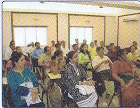
Invitees listening intently at the Inaugural function