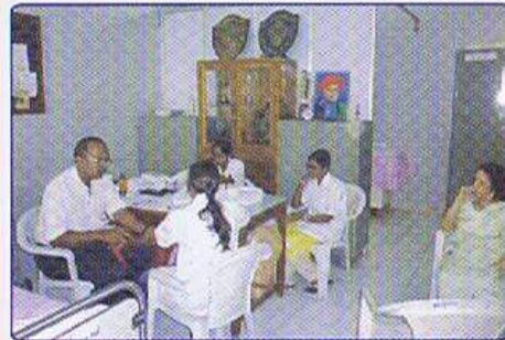
A routine blood test is on