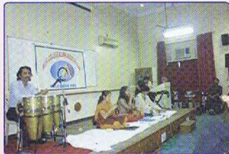
Three alumni regaling the audience with some foot tapping numbers at the RCAA get-together function