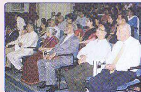
A section of the elite audience at the Jewel of Ruia awards function